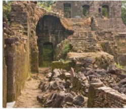
CARMICHAEL PRIZE ESSAY...